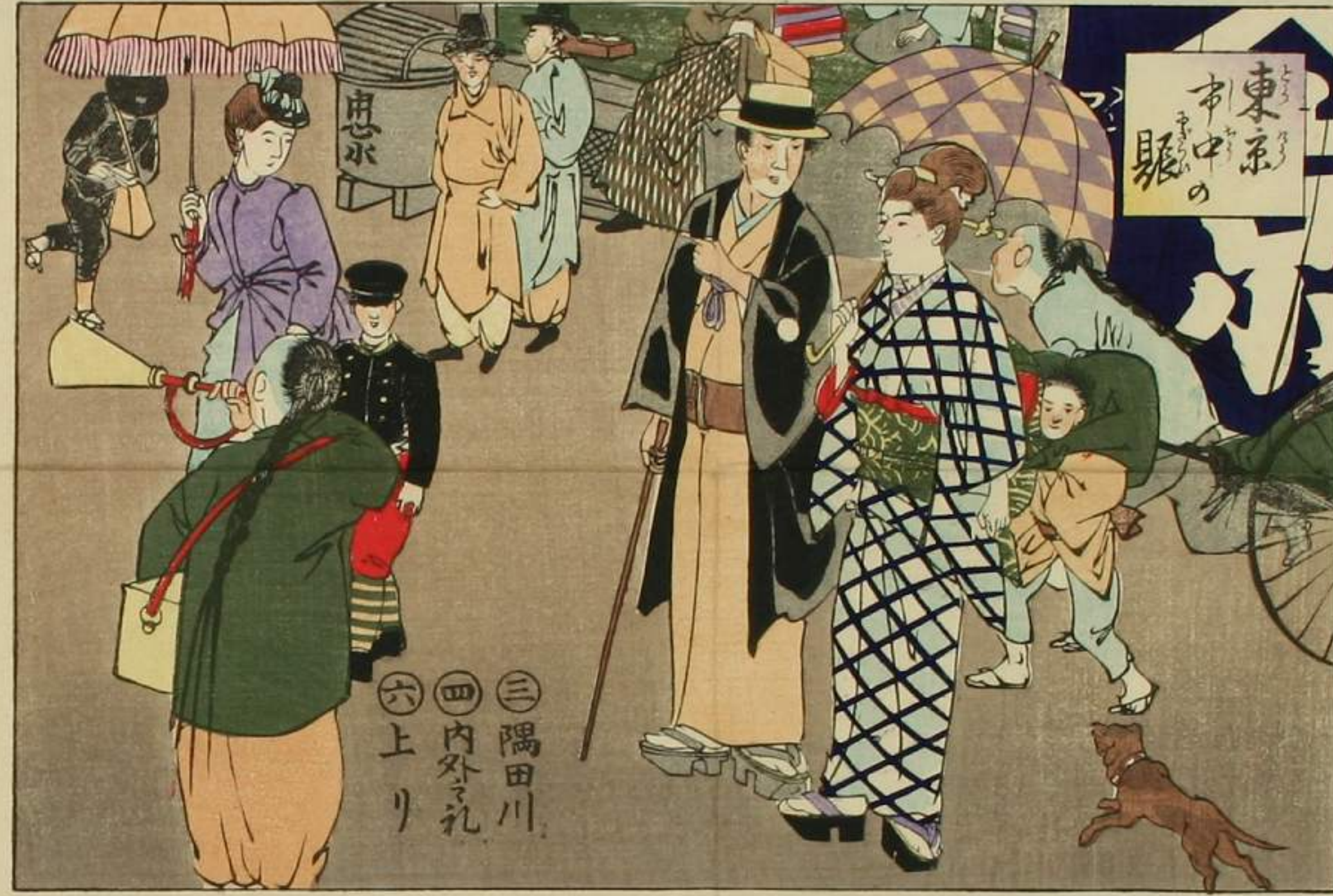
THE CITY OF TOKYO.