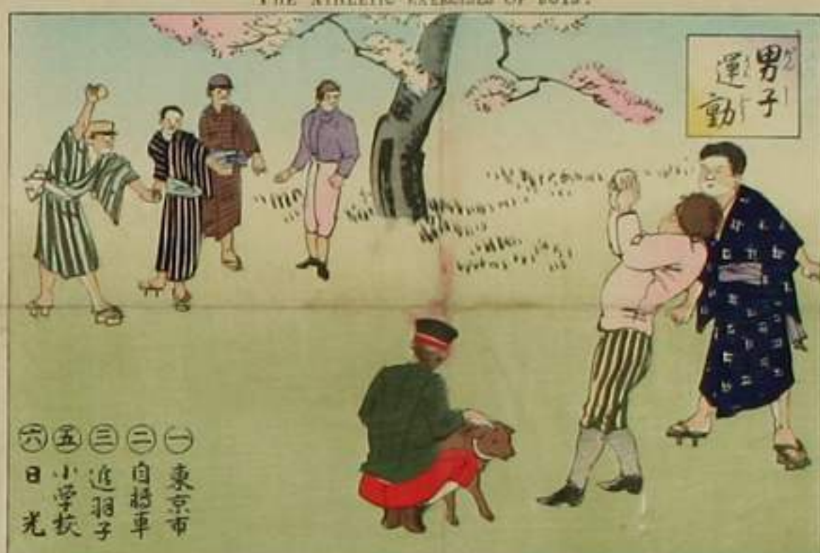
THE ATHLETIC EXERCISES OF BOYS.