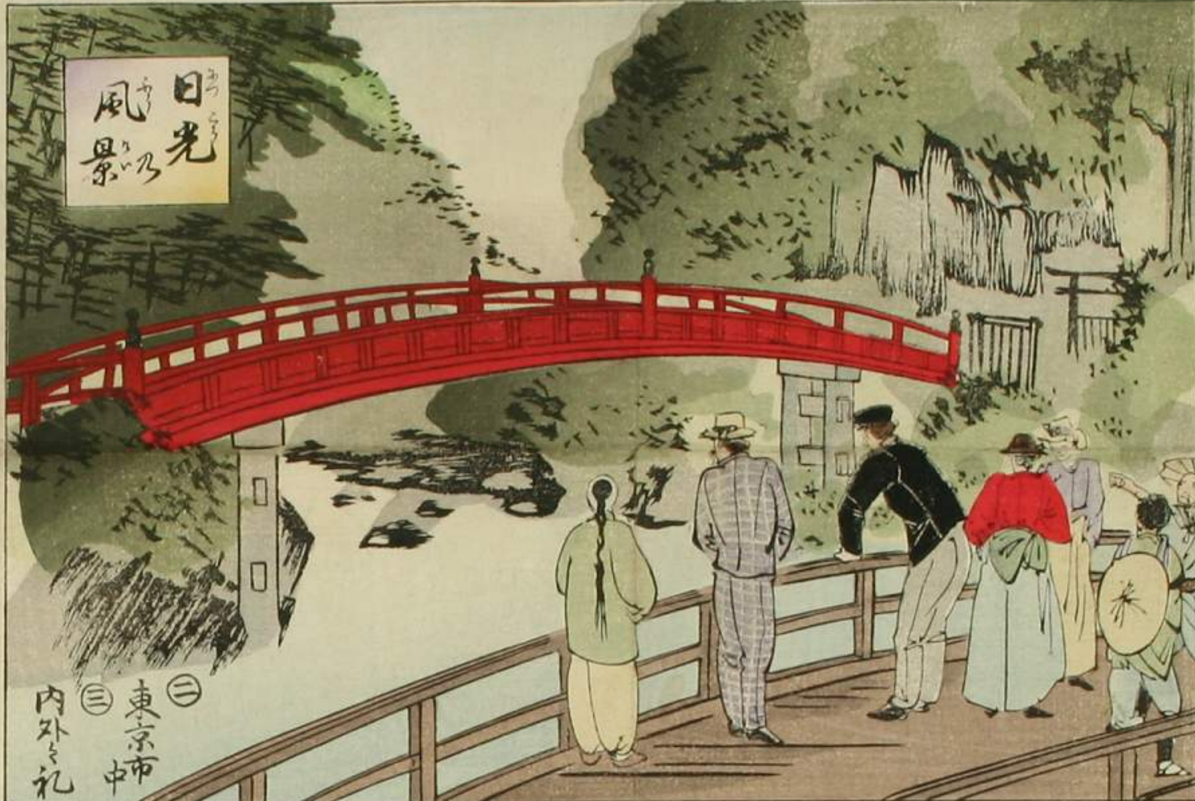
THE SCENERIES OF NIKKO