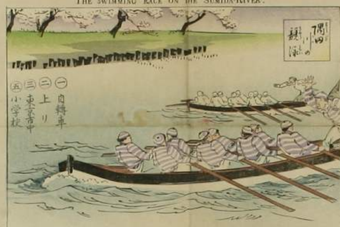
THE SWIMMING RACE ON THE SUMIDA RIVER.