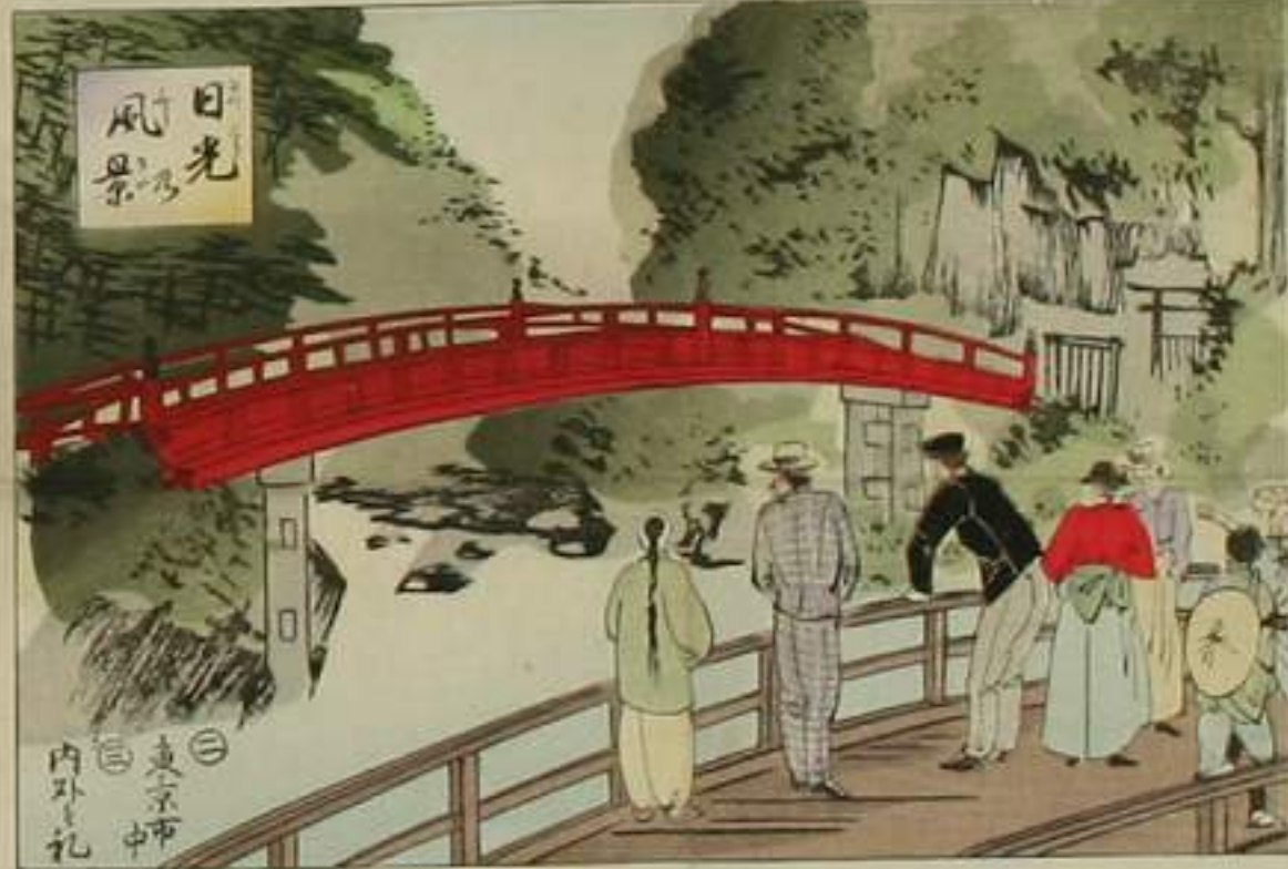
THE SCENERY OF NIKKO.