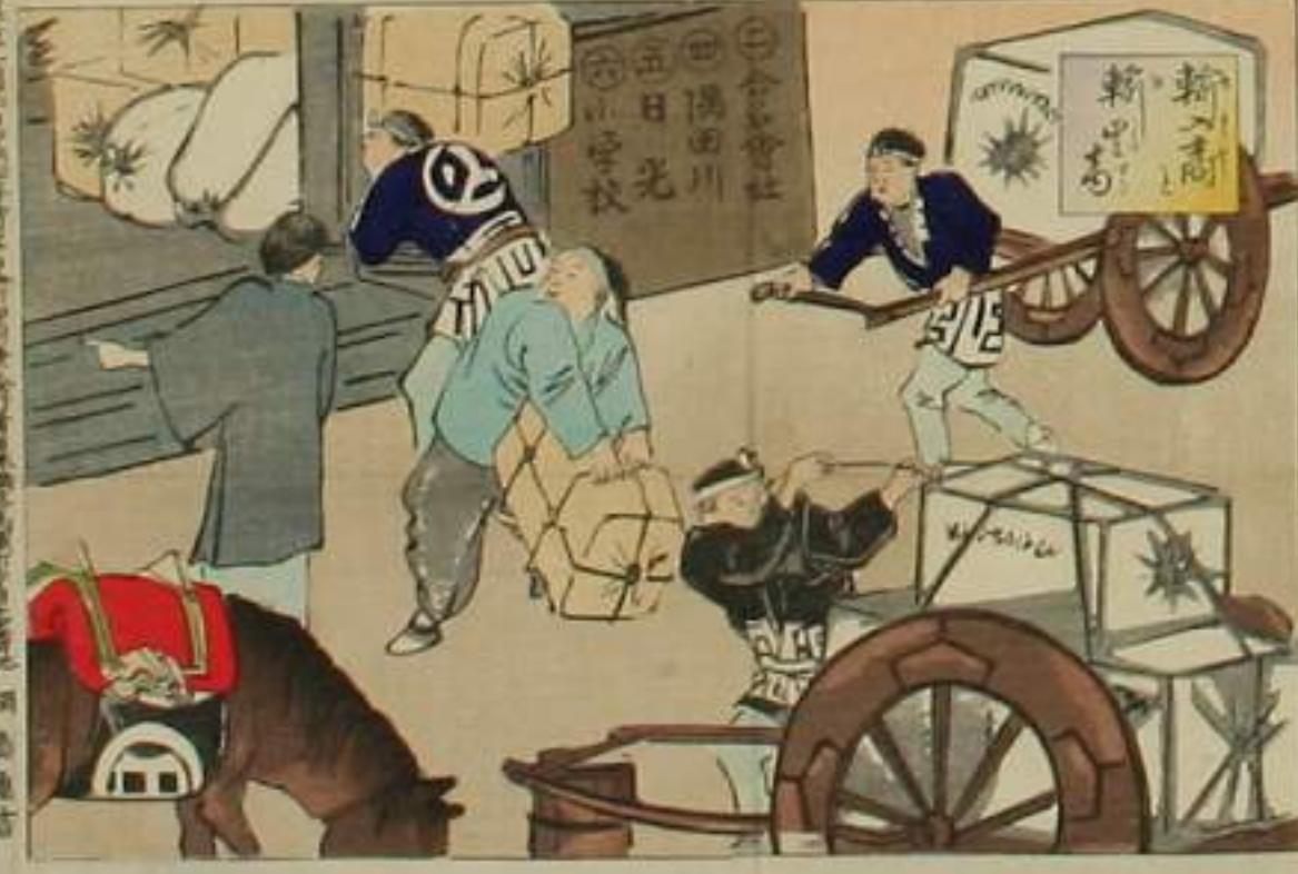
IMPORTER AND EXPORTER.