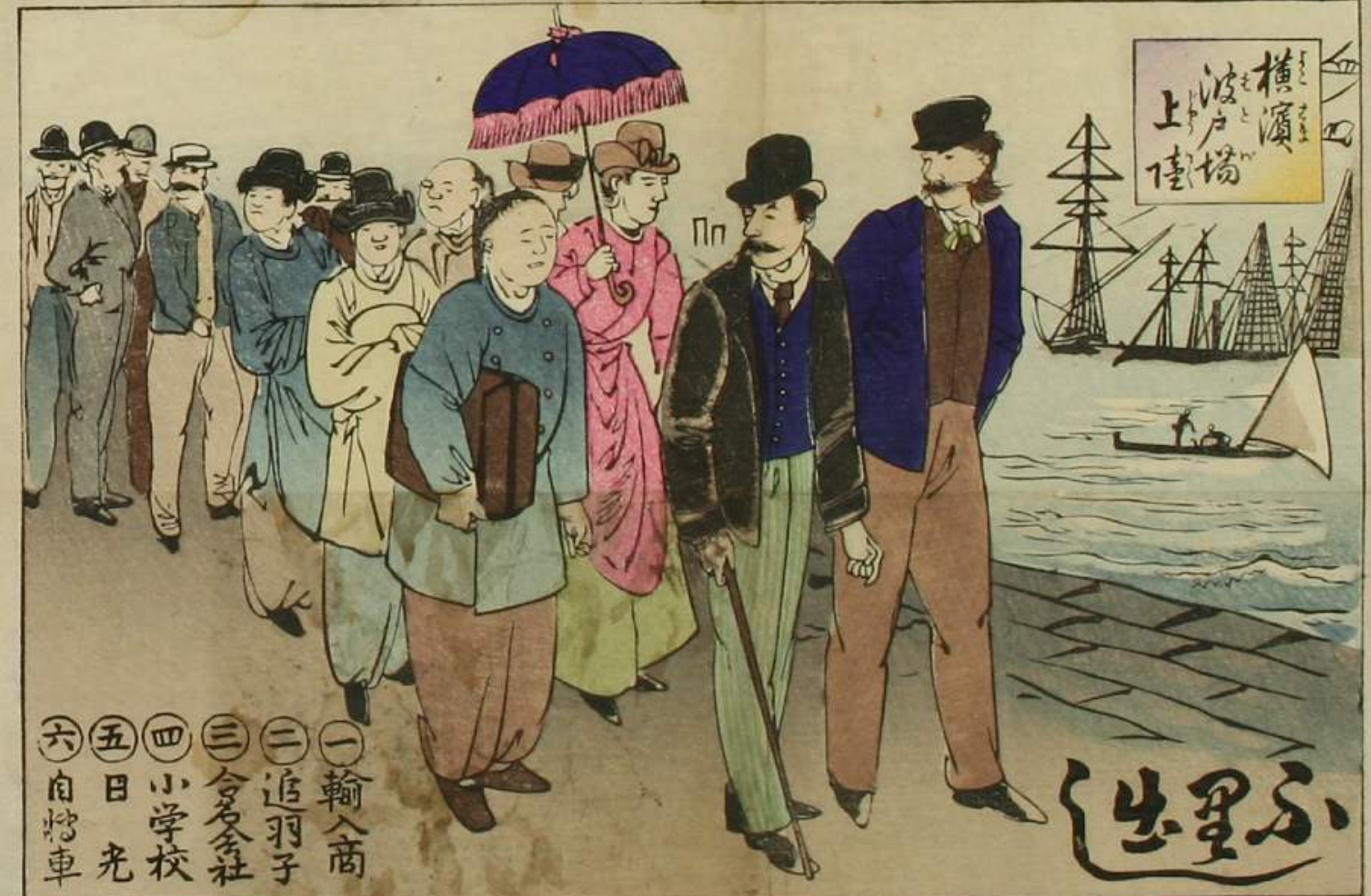
THE WHARF OF YOKOHAMA