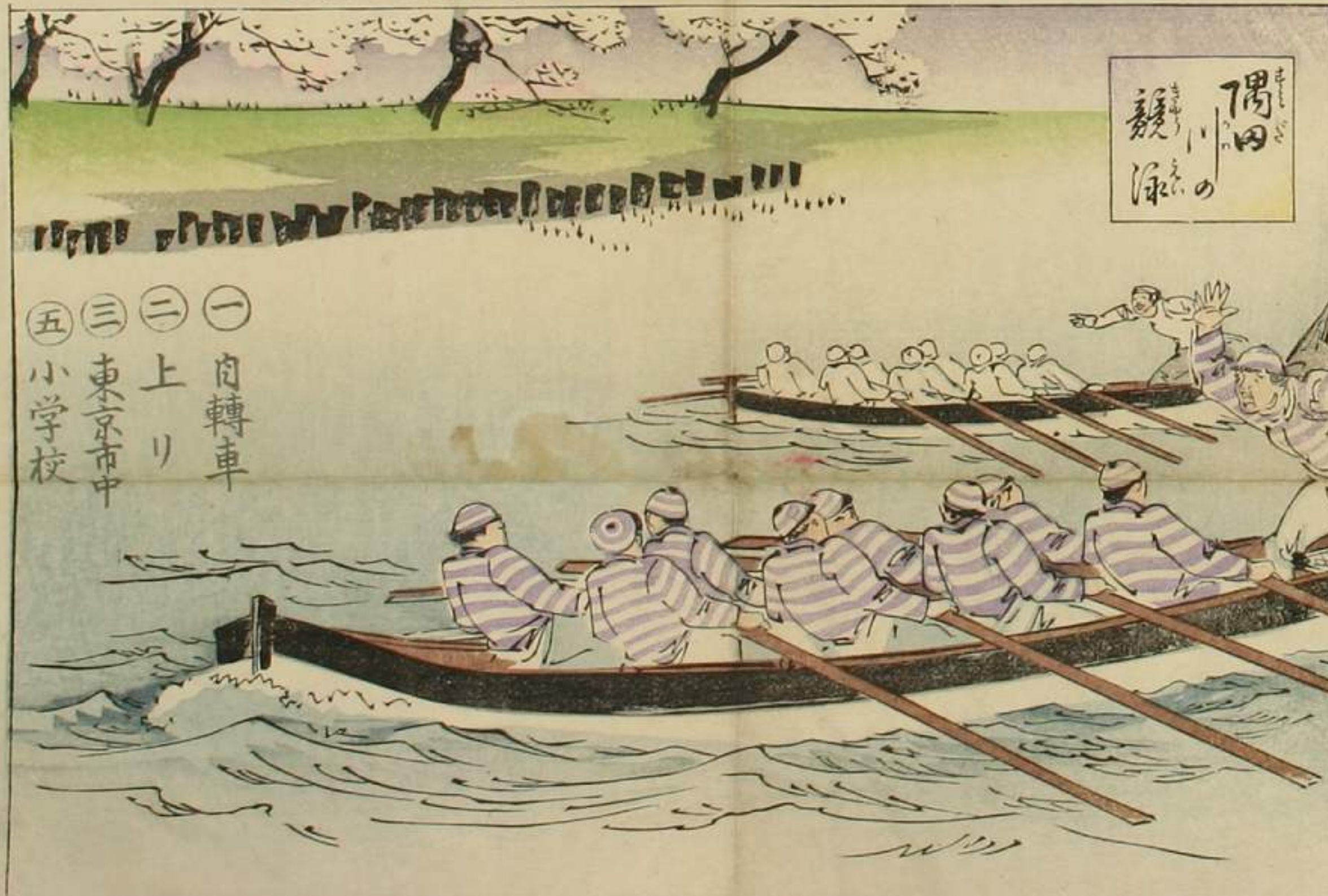
THE SWIMMING RACE ON THE SUMIDA-RIVER.