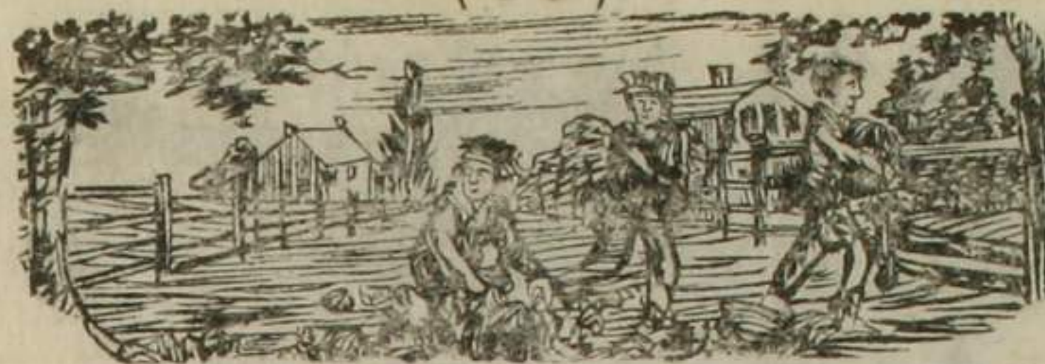
Wicked Boys stealing Fruit.

Did you ev-er go in-to a mine, deep, deep, un-der ground? No, nev-er. Well, here is a pic-ture of a mine, where the men are digging coal. It is found at great depths in the earth, and the mi-ners dig deep pits to get it out. Salt, gold, silver, lead, i-ron, tin, zink, cop-per, and oth-er met-als, are dug out of mines. Ma-ny mi-ners are killed by the earth and rocks fall-ing on them, or when wa-ter runs in-to the mines. Boys and girls on-ly sev-en or eight years old work in the coal, and i-ron, and lead mines, in Eng-land.