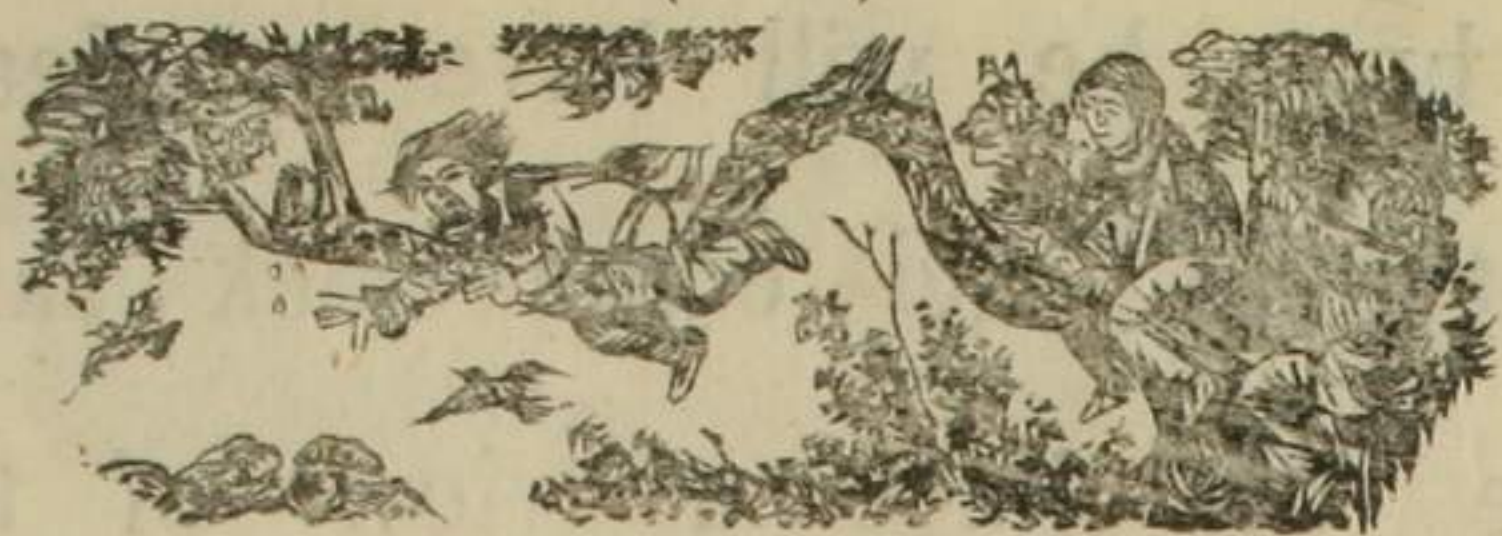
Boys robbing a Bird's Nest.