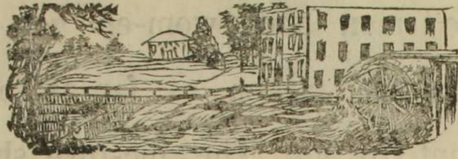
The Mill-stream and Flour-Mill.