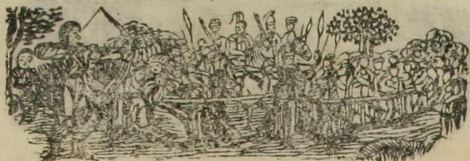
William Tell and his Son.