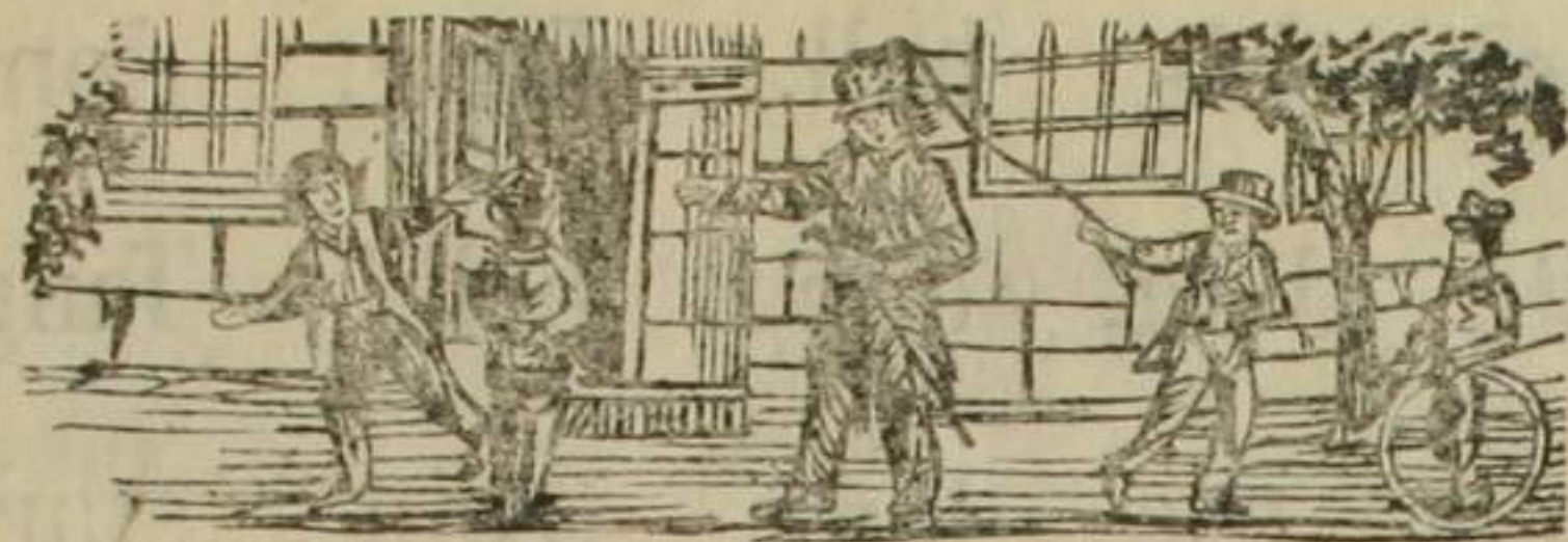
The Poor Man.