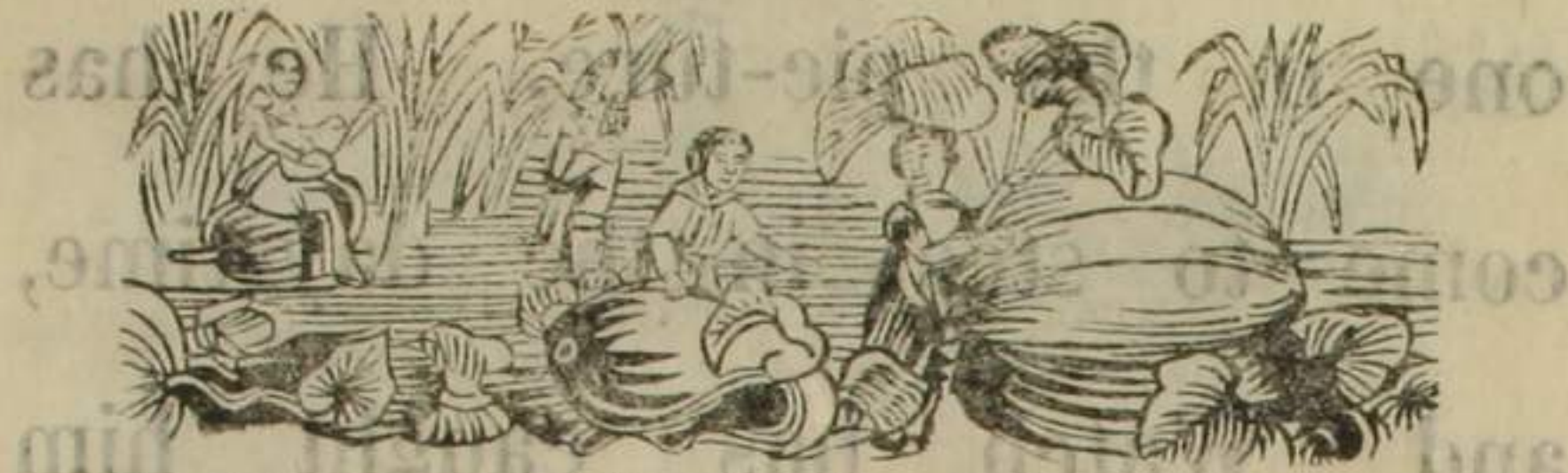
The Farmer is rewarded with exuberant Crops for his Labor.