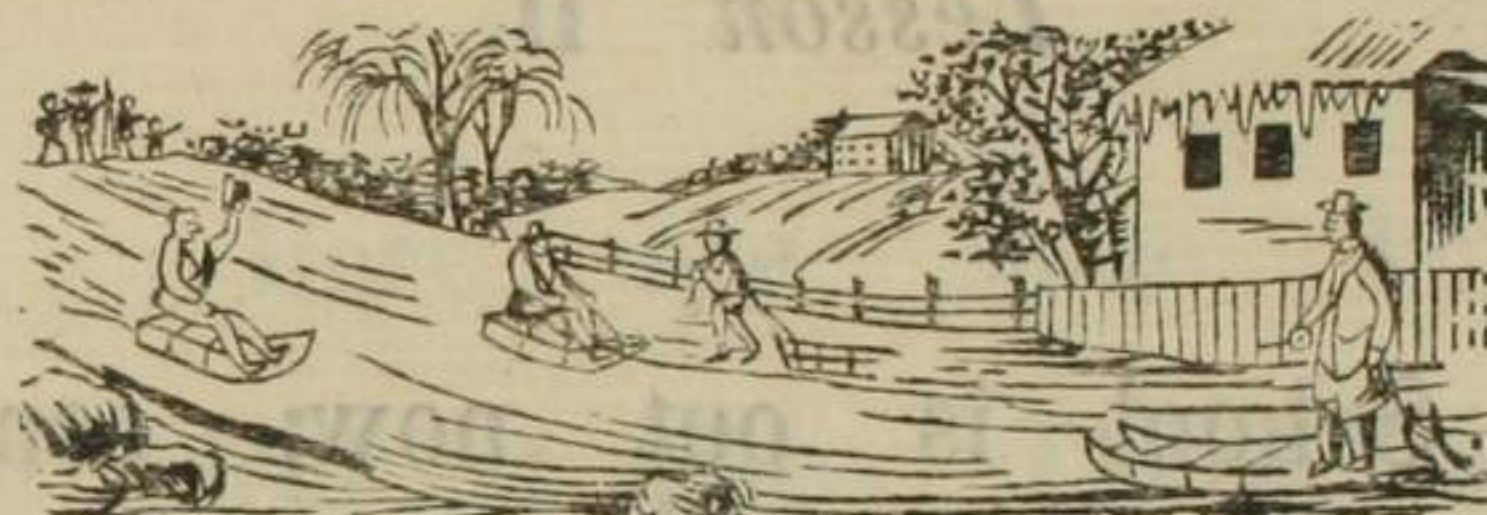
Boys sliding down Hill on Sleds.