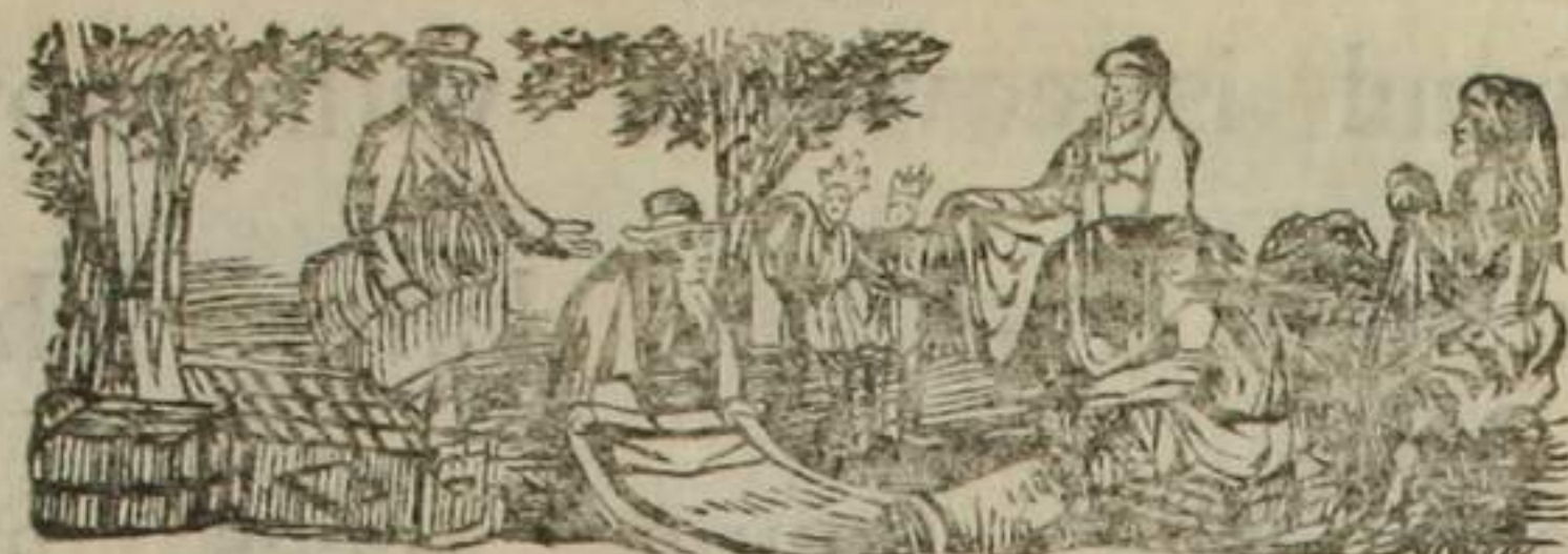
William Penn and the Indians.