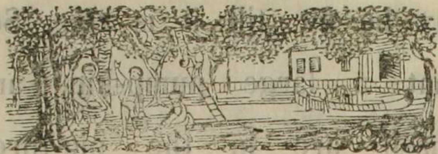
Gathering Fruits in Autumn.