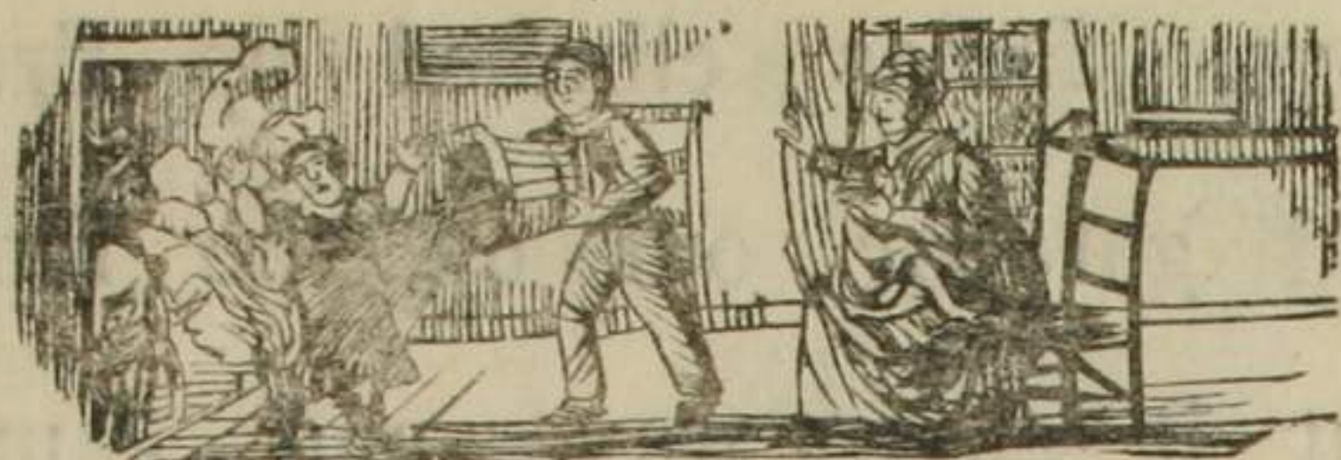
Do not go too near the Fire.