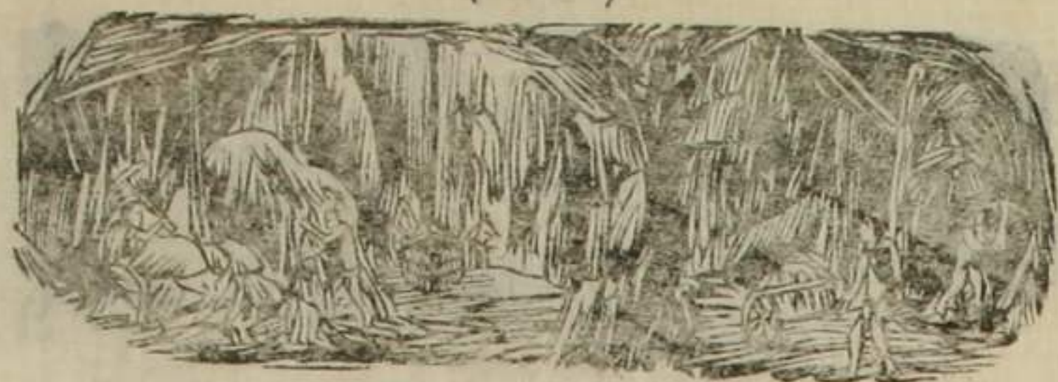
The Coal Mine.