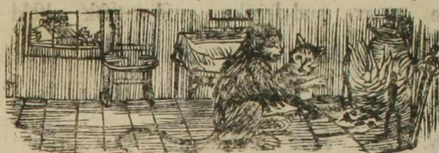
The Monkey and the Cat's Paw.

Come here, James. Have you ever read the story of William Tell and his little son? He was a man who loved liberty, and wanted to free his country from the rule of a tyrant. One day the tyrant, hearing that Tell was a good archer, to punish him for his love of freedom, had his son tied to a post, with an apple on his head. He then told Tell to take a bow and arrow and fire at the apple. He wanted the father to kill his own son. But Tell shot his arrow through the apple, and the boy was saved.