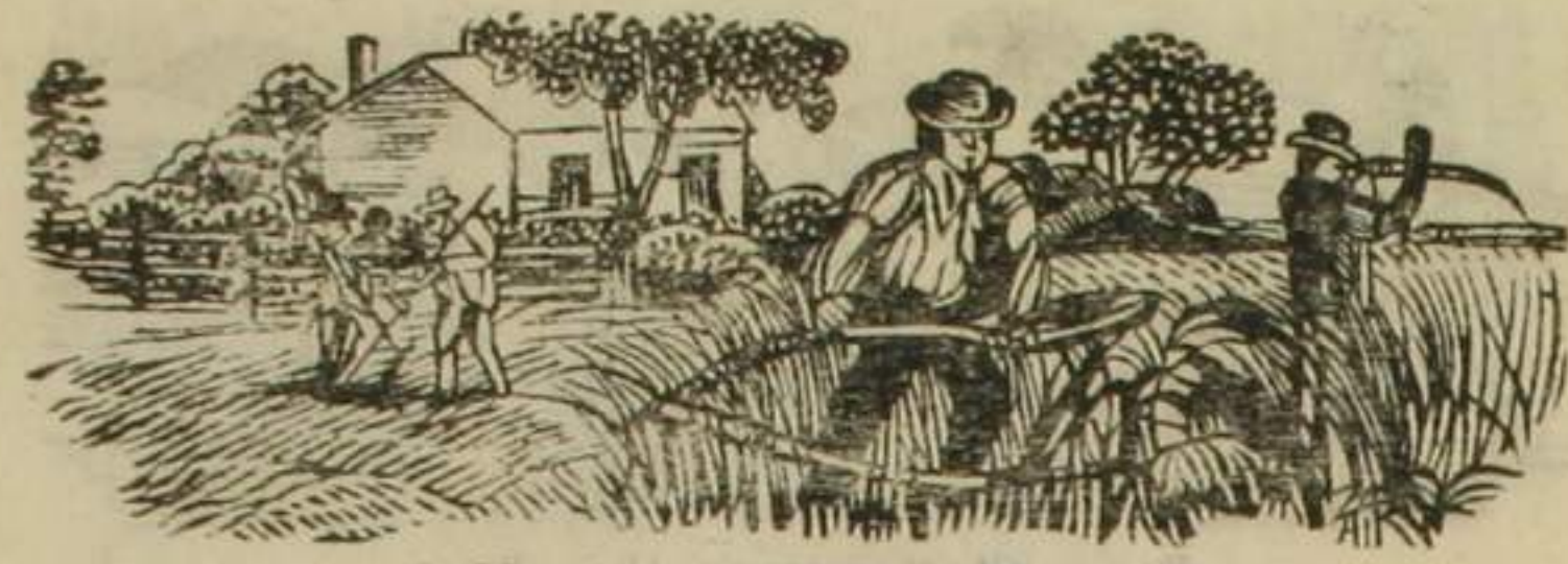
A Morning in Harvest-Time.