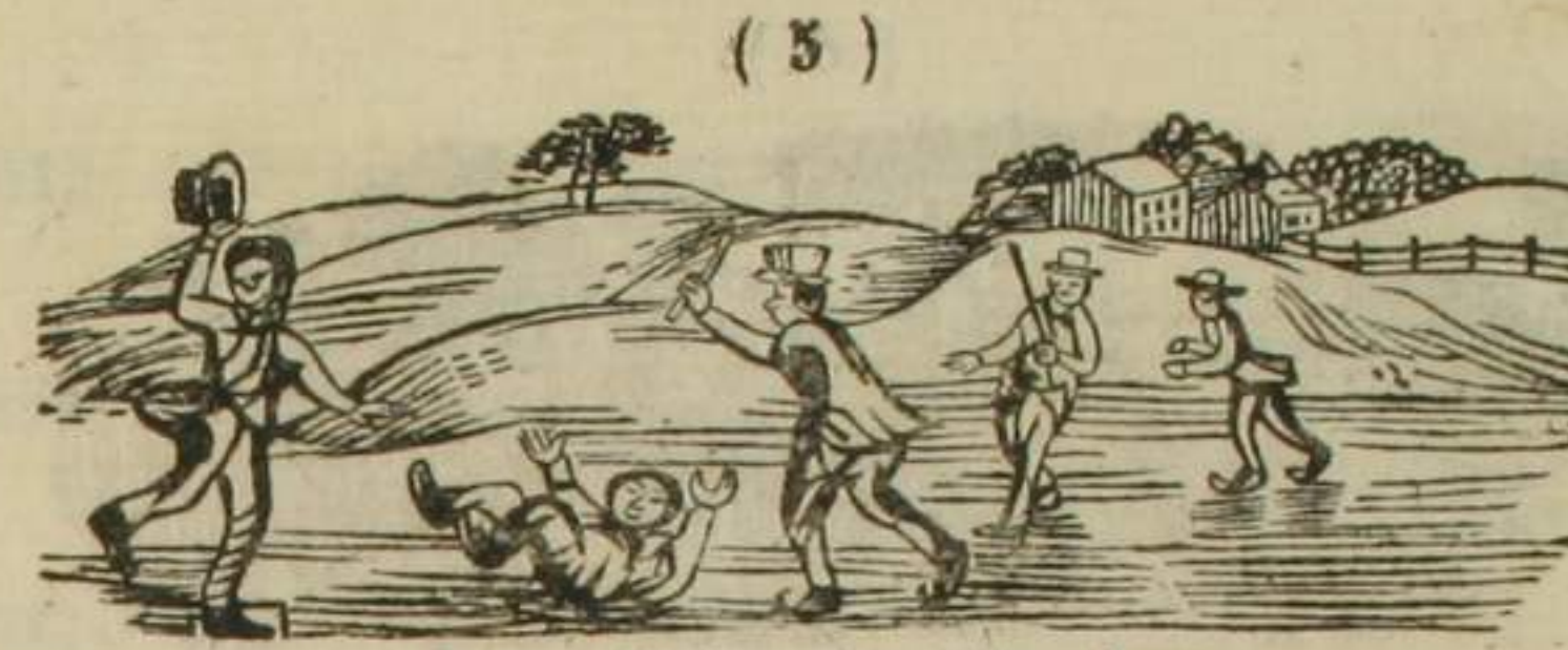
Boys Skating on the Ice.

The wasp is a small in-sect, with a sharp sting. It makes a sharp, hum-ming sound, when it flies. Here are some boys who have struck a wasp's nest, and the wasps are all in a rage. The boys will get stung. The nest is in the shape of a cone, with the point down. It hangs from the limb of a tree.