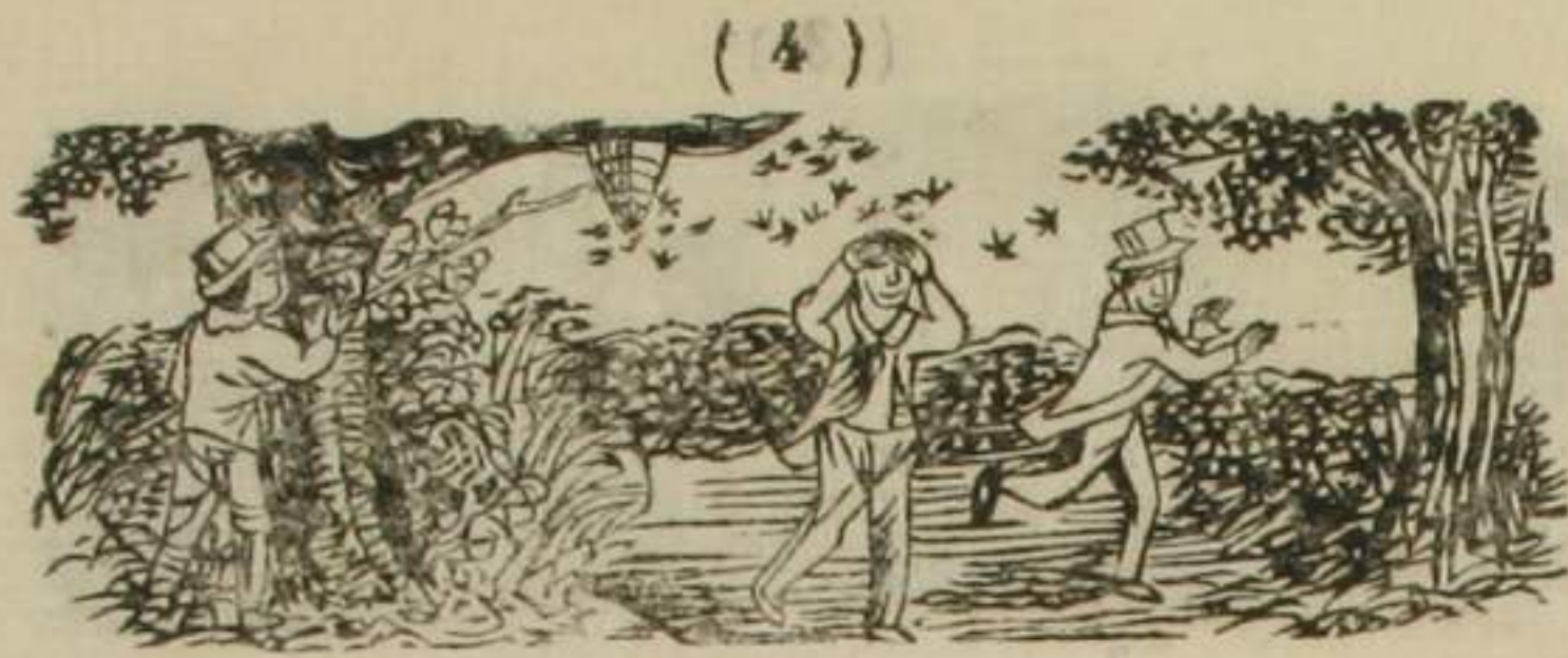
Foolish Boys striking a Wasp's Nest.