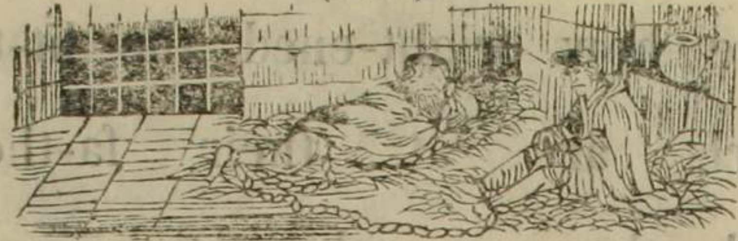
"We punish bad men to prevent crimes."—webster's Pictorial Speller.