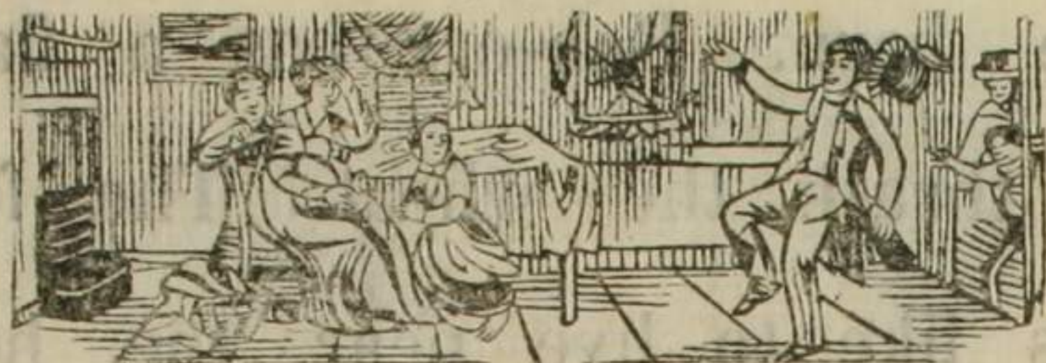
"We look with amazement upon the Evils of Strong Drink."