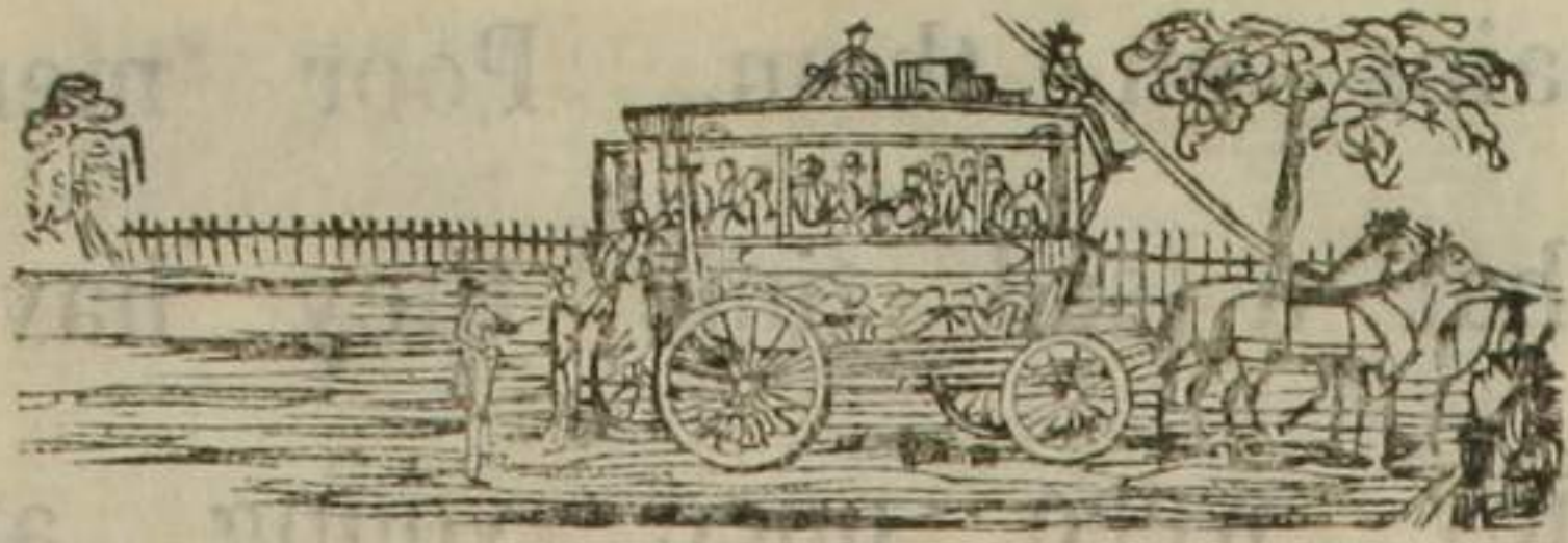
Omnibus, Driver, Trees, Street, Bowling, Green.