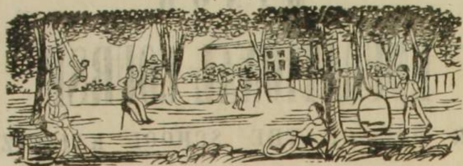
Playing after School.