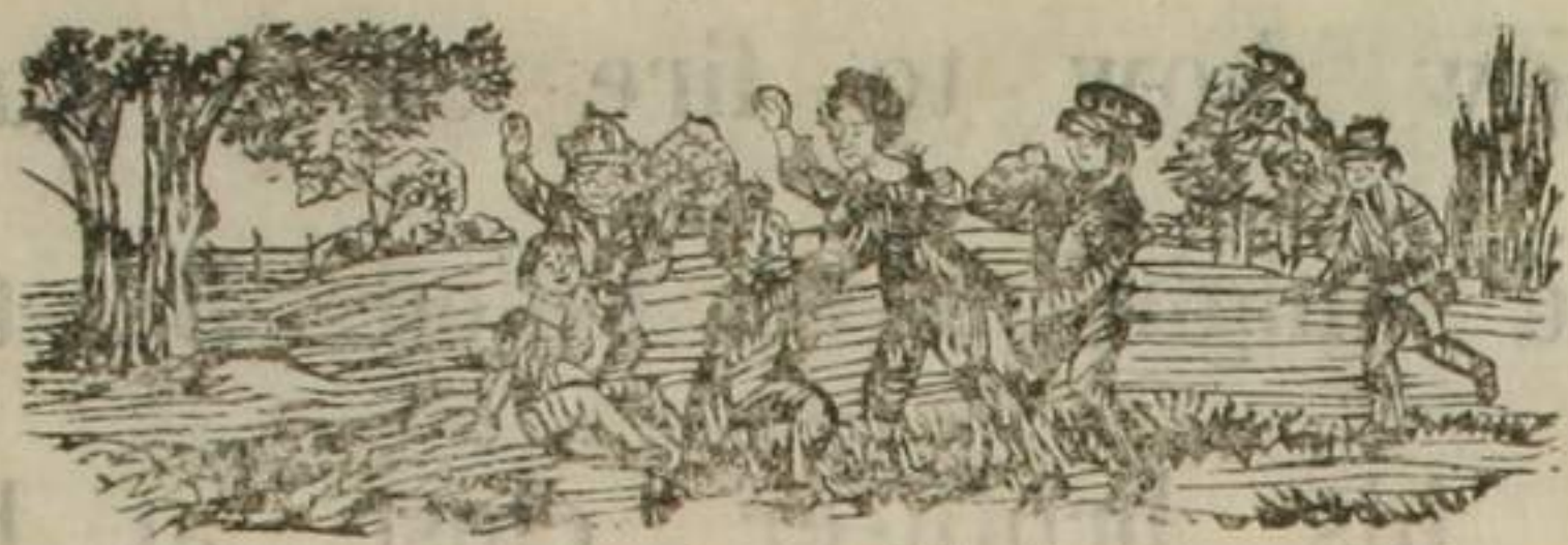
The quarrelsome Schoolmates.