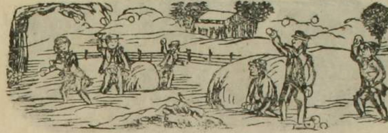
A Holyday in Winter.

GEN-ER-AL WASH-ING-TON was an em-i- nent and il-lus-tri-ous man. He was as good as he was great. He led the ar- mies of our coun-try on the field of bat- tle. He had great wis-dom, pru-dence, and pi-e-ty. The pic-ture shows a Brit-ish gen- er-al, Lord CORN-WAL-LIS, giv-ing up his sword to him, be-cause he had gained the bat-tle. He is called the FA-THER OF HIS COUN-TRY. When he was a boy, he was stu-di-ous, and was nev-er known to tell a lie. Let all boys and girls strive to fol- low his bright ex-am-ple.