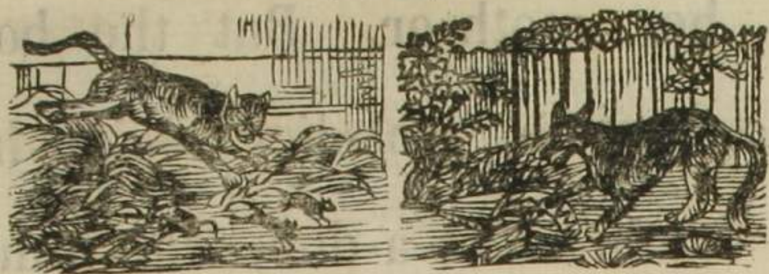
The Cat and the Fox.