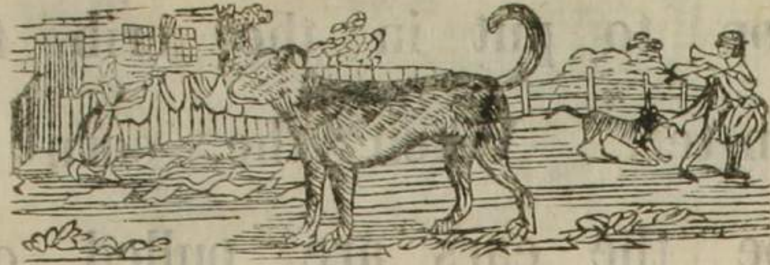
The Mastiff or Watch Dog.