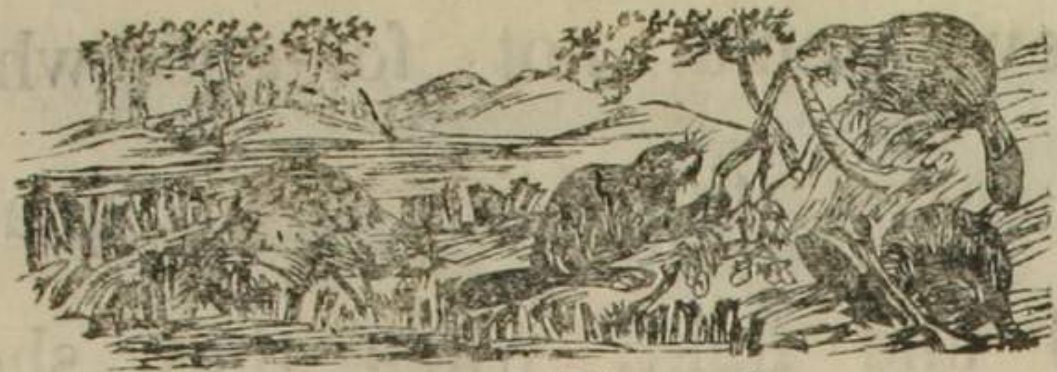
The Beavers building a Dam.