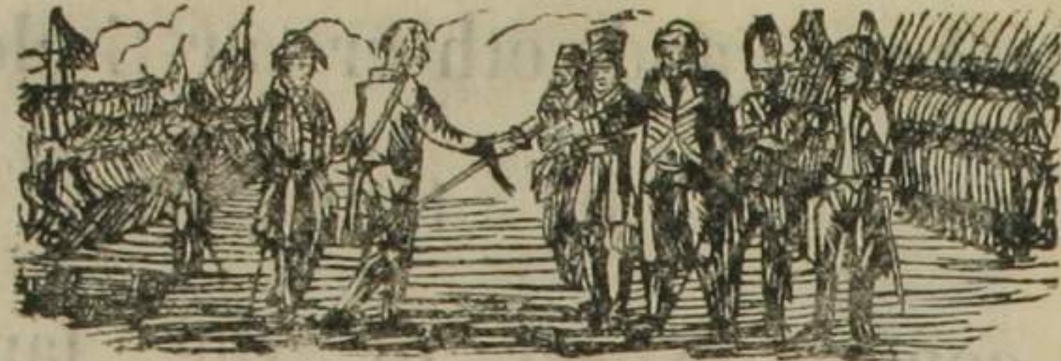
George Washington at Yorktown, Virginia.