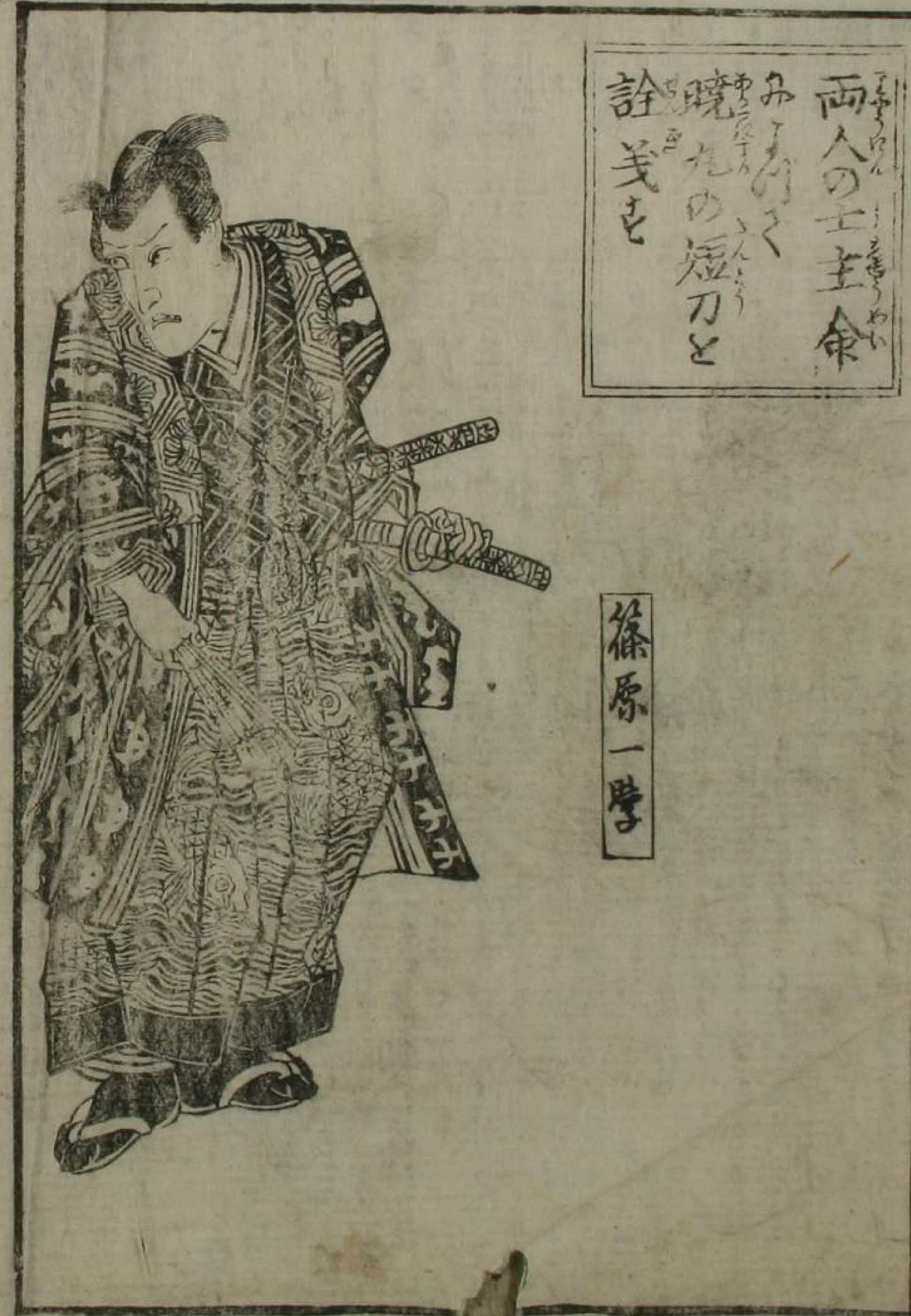
二人の土主命 暁丸の短刀と 詮美と